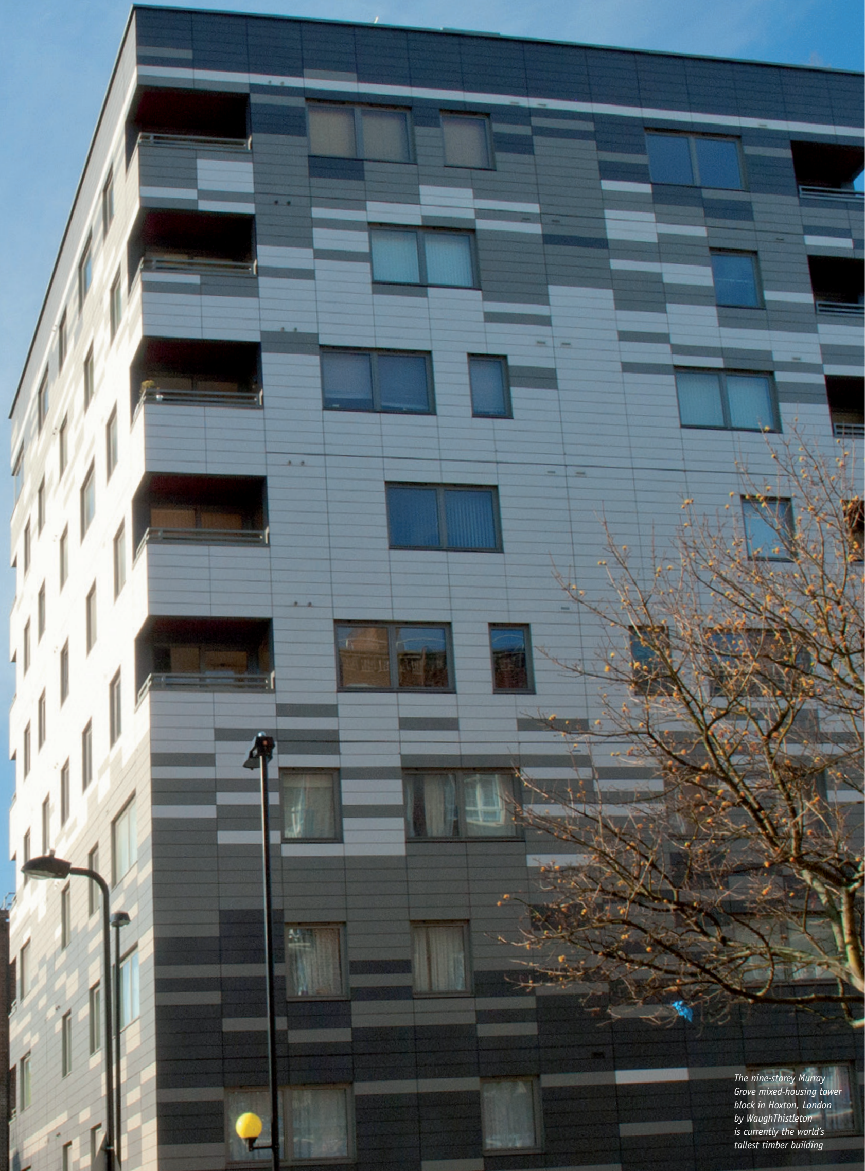
The nine-storey Murray Grove mixed-housing tower block in Hoxton, London by WaughThistleton is currently the world's tallest timber building